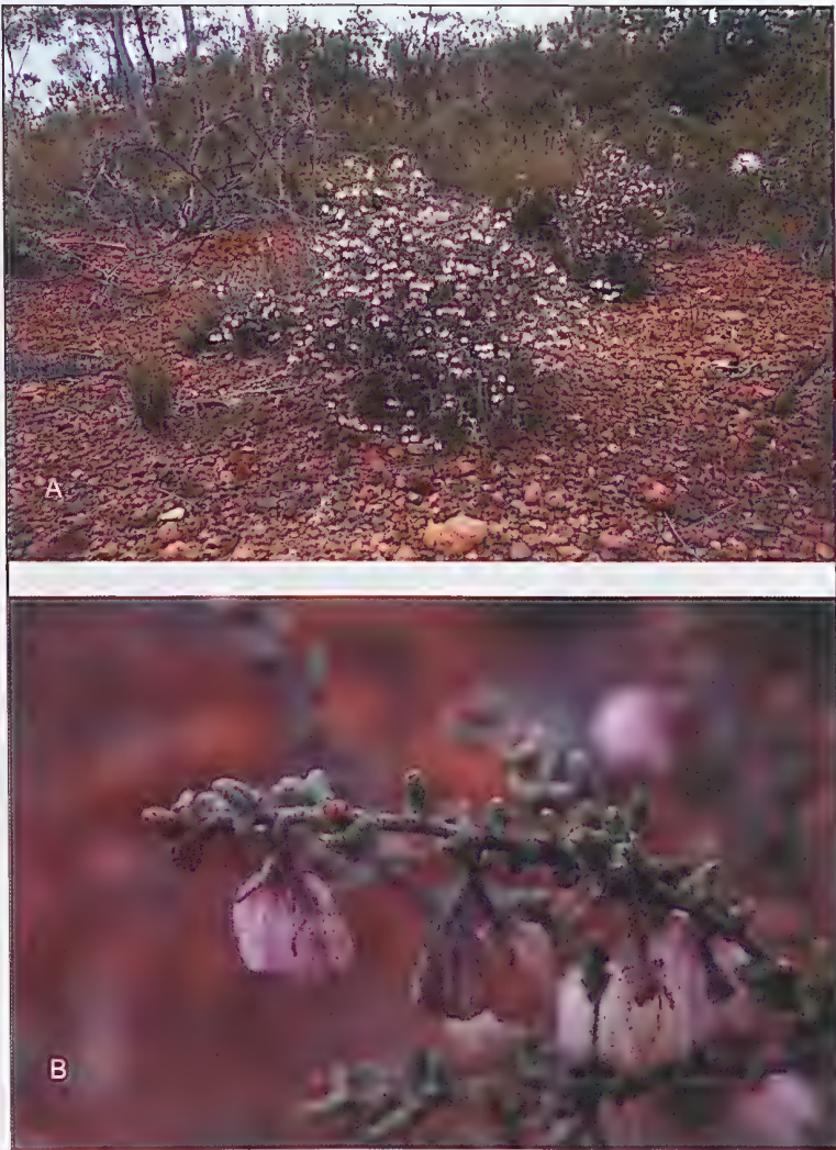
Figure 5. Guichenotia apetala A.S.George. A – habit; B – flowering branchlet. (C. Wilkins 1836).

Seed one per locule, ellipsoid, c. 2 \times 1 mm, outer surface dark brown, smooth, with medium-dense, sessile, fine, white, stellate hairs. Aril cap-like with short lobes (seed voucher K. Newbey 568; Wilkins & Chappill 2002a). (Figures 4, 5A & 5B)